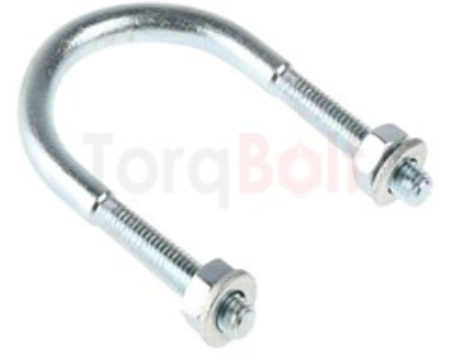
HEX CAP SCREWS